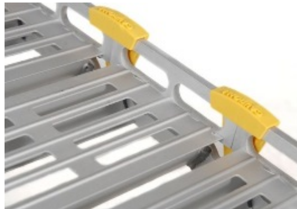
Roll-A-Ramp® will hold up in any weather. Ramp can be left outside all winter without worry about rusting. Snow on top will pass through or can be brushed off and the treads allow for slip-free movement