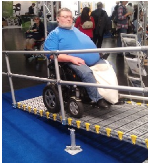
Ramp is tested by children and adults at Rehacare Medical Tradeshow in Dusseldorf, Germany.